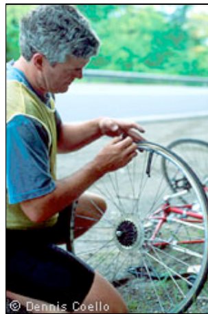
Sharpen your skills before hitting the road

Repairing a flat tire is one of the most fundamental and important repair skills every cyclist should have. You never know when that shard of glass or hard-edged debris will wedge its way through your tire and bite into the soft rubber of your inner tube. Having the tools and know-how to repair this common problem is vital.