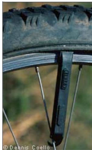
Removing the tire

This is the hard part. Your tire irons are the tool of choice. First, make sure that all the air is out of the tire. Press and squish to make sure of this. Then, using the beveled end of the tire iron (the end without the hook!), pry the tire off.