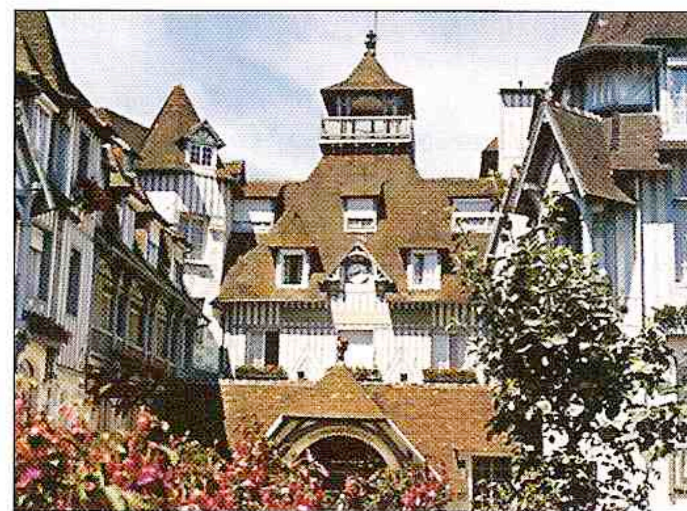
Hôtel Normandy Barrière

The next day, we dropped off the car and trained back to Paris for our flight home. Who would have thought the kids would be so captivated? Who could have imagined that they would learn—and remember—so much? We cannot thank our diarist friend enough for helping to make our family trip a wonder.