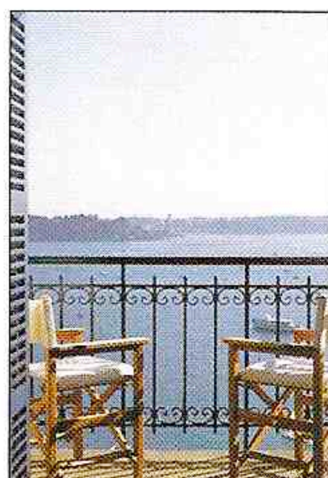
Grand Hôtel Barrière