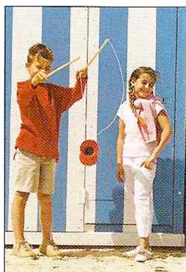
Golf International Barrière La Baule