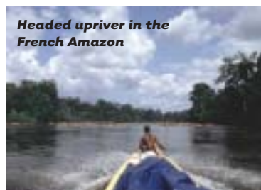
Headed upriver in the French Amazon

French Guiana, or Guyane, as it is known to French speakers, is the small French département on the northern coast of South America sandwiched between Suriname and Brazil. Since 1502, it has been prospected and administrated by the French. The protection of biodiversity and development of