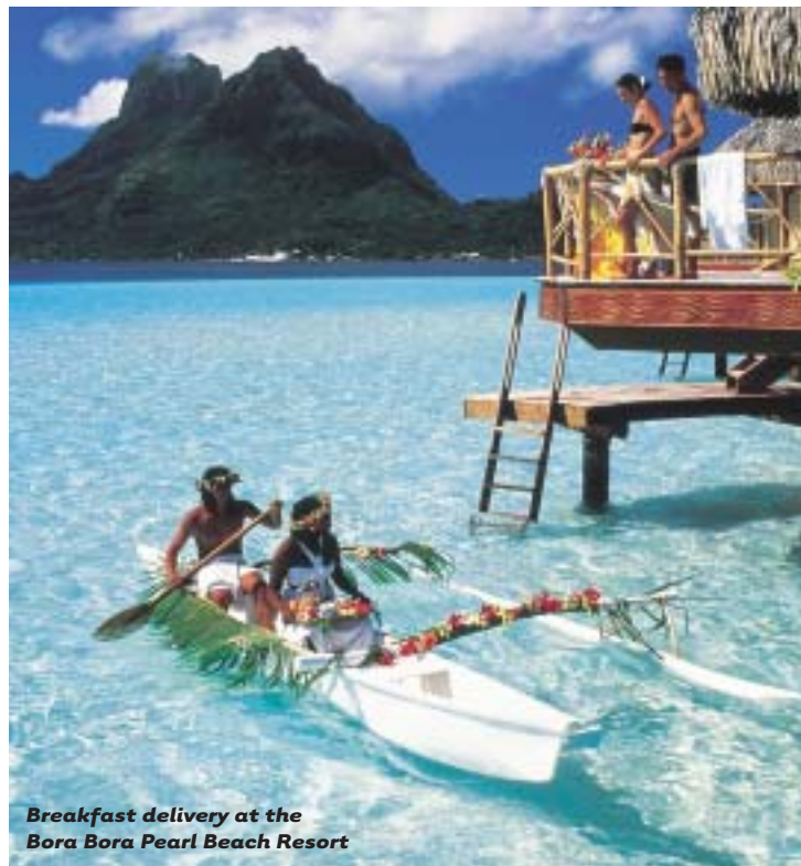
Breakfast delivery at the Bora Bora Pearl Beach Resort

Some special occasions call for a special treat. And few treats are more uplifting than awakening after a night of gentle rocking to a sky thick with rainbows and a horizon filled by cobalt waters and a mist-shrouded volcanic peak. So it always is on a honeymoon or anniversary cruise in French Polynesia. Most French Polynesian cruises set sail from Papeete, the capital of Tahiti, since many cruise packages include airfare to Tahiti from the West Coast of the United States. A week-long slide into a watery Eden ensues, and can come complete with island visits for sports pleasures (jeep trips, hiking, boating, kayaking, scuba, and snorkeling), beach ease, and food and drink indulgence; over-the-top wow opportunities (helicopter flights, pre- and post-trip lagoon resort stays in stilt bungalows with glass floors); and on-board classes, entertainment, and feasting.