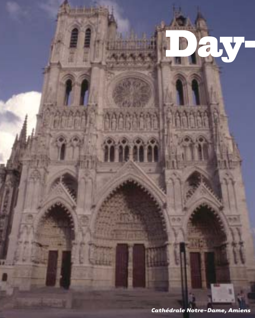
Cathédrale Notre-Dame, Amiens

the year in 2004, €89.50 will buy you round-trip transportation to Caen, transfers to and from the train station to the Mémorial de Caen , a bilingual guide who will provide commentary on visits to the Mémorial and to the D-Day Landings beaches , and a handbook called The D-Day Landings . See www.memorial-caen.fr for more information.