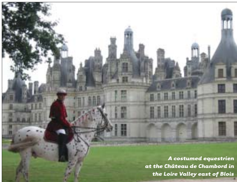
A costumed equestrian at the Château de Chambord in the Loire Valley east of Blois

South of Tours, in Poitou-Charentes, are Poitiers , one of France's oldest cities, which also has one of its most modern attractions—the Futuroscope theme park—and Angoulême , France's national comic-book center. The city of Limoges , capital of the Limousin region is renowned for its enamel and porcelain, great examples of which are on display in the Musée National Adrien-Dubouché . Also in town is the 13th-century Gothic Cathédrale St-Etienne . ♣