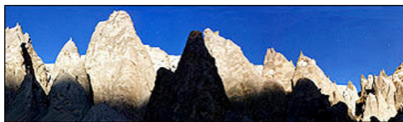
Cappadocia's moonscape features.

Intro | Ilha Grande (Brazil) & Prescott (Arizona) | Dalmatian Coast (Croatia) & Eureka (Arkansas) | Catalina Island (California) & Inle Lake (Myanmar) | Zanzibar (Tanzania) & Baxter State Park (Maine) | Cappadocia (Turkey) & Door County (Wisconsin) | Practicalities